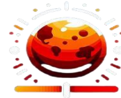
Planet size indicator

As you traverse the planet's surface, be mindful of its shrinking size, which poses a constant challenge to your navigation. But fear not, for scattered across the planet are powerful orbs that, when collected, restore its size and grant you renewed vitality.